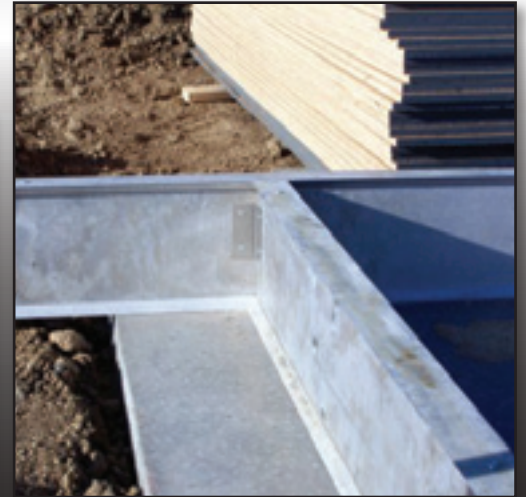
Corners connect easily with brackets