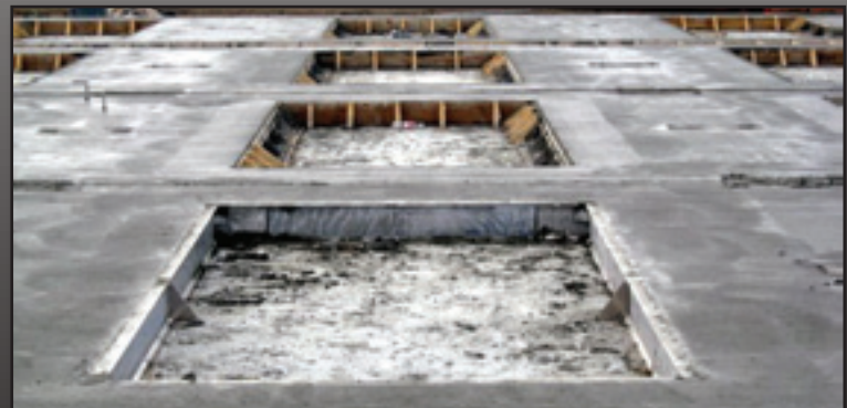
Bracing Comparison - Aluminum vs Wood 6'14' Window Opening