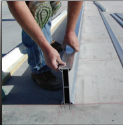
Chamfer available in 1/2" and 3/4"