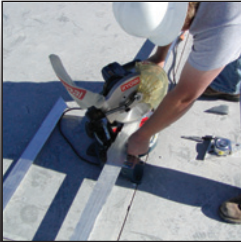
Cuts easily with Carbide Miter Saw