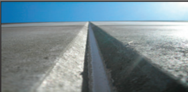
The superior result achieved using a rigid chamfer