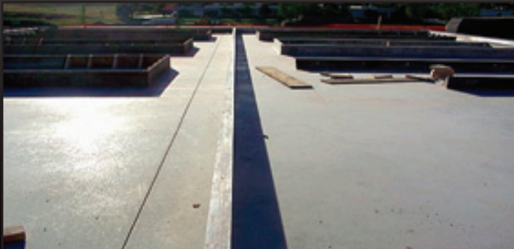
58' common form with chamfer